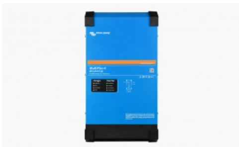
Bornay Victron Energy Multiplus II

The MultiPlus-II combines the functions of the MultiPlus and the MultiGrid, including all the features of the MultiPlus, plus an external current sensor (option) which extends the PowerControl and PowerAssist function to 100A.