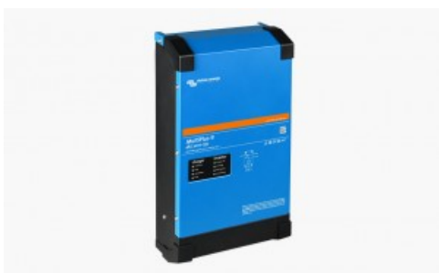
Bornay Victron Energy Multiplus II