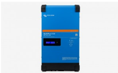
Multiplus II - GX