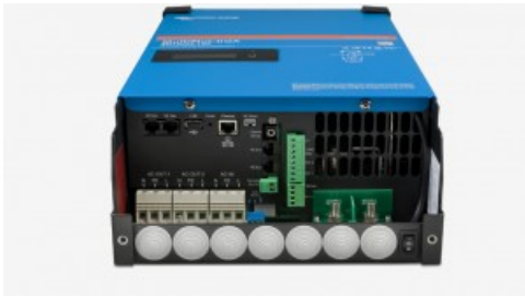
Multiplus II - GX