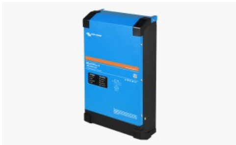
Bornay Victron Energy Multiplus II