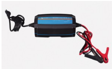
Cargador de baterías Victron Energy BluePower