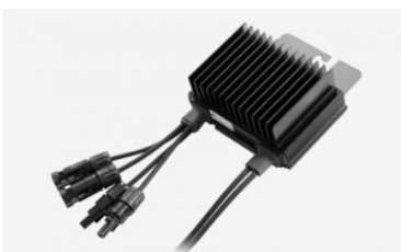
Optimizator SolarEdge P800