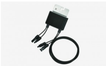
Optimizator SolarEdge P850