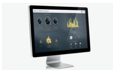
Sistema de Monitorización SolarLog

The low cost failure and yield monitoring system for plants with a maximum photovoltaic power of 15 kWp. Includes alarm function and graphic evaluation on PC.