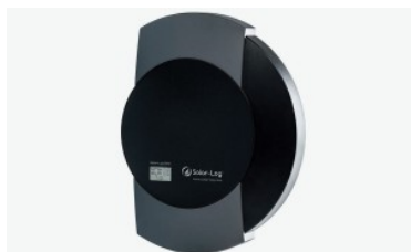
Sistema de Monitorización y Rele de Vertido 0, SolarLog 300