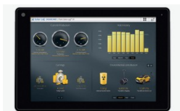
Sistema de Monitorización SolarLog