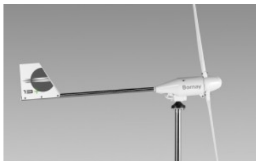
Aerogenerador minieólica Bornay Wind 13+

Wind + is the result of over 45 years of experience in the small wind industry, where Bornay has worked hard to innovate and to get a so far unknown result.