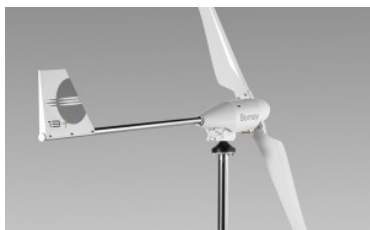
Aerogenerador minieólica Bornay Wind 13+