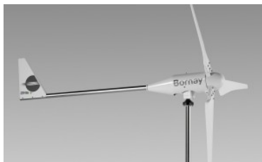
Aerogenerador minieólica Bornay Wind 25.3+