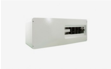
Bornay Schneider Electric Accesorios Conext SW