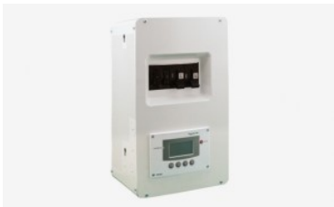
Bornay Schneider Electric Accesorios Conext SW