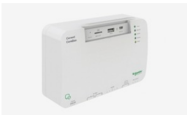
Bornay Schneider Electric Conext ComBox