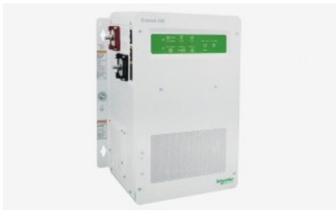
Bornay Schneider Electric Conext SW

The Conext™ SW solar inverter/charger delivers new value and a new price point to the marketplace