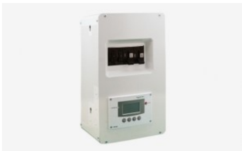
Bornay Schneider Electric Accesorios Conext SW