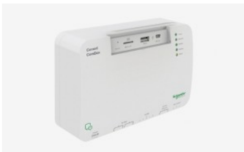
Bornay Schneider Electric Conext ComBox