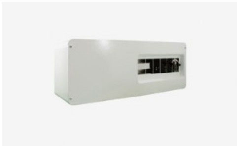
Bornay Schneider Electric Accesorios Conext SW