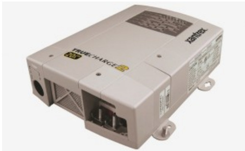
Cargador de baterías Xantrex TrueCharge

Ultimate, High Performance, Worldwide Charging