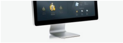
Sistema de Monitorización SolarLog

The low cost failure and yield monitoring system for plants with a maximum photovoltaic power of 15 kWp. Includes alarm function and graphic evaluation on PC.