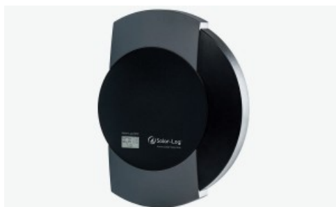
Sistema de Monitorización y Rele de Vertido 0, SolarLog 300