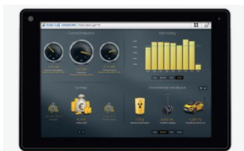
Sistema de Monitorización SolarLog