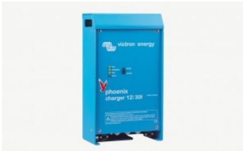
Cargador de baterías Victron Energy Phoenix