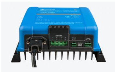
Phoenix Smart IP43 3