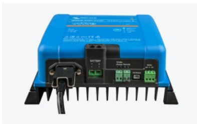
Phoenix Smart IP43 1+1