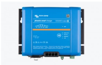
Phoenix Smart IP43 3