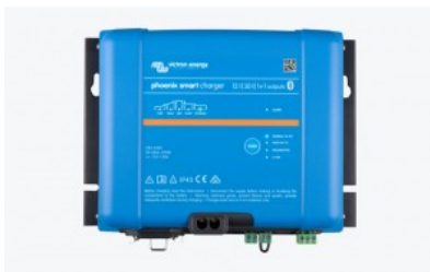
Phoenix Smart IP43 1+1

With boat owners in mind this adaptive 5-step charger can provide charge to each of three battery banks. Bluetooth enabled. Adaptive, intelligent, dynamic charge features – see the datasheet below.