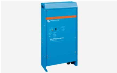
Inversor / Cargador Victron Energy Phoenix Multiplus 12/2000