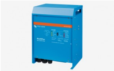
Inversor/Cargador Victron Energy Phoenix Multiplus