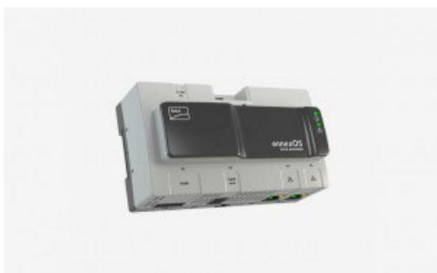
SMA Data Manager M