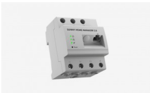
SMA Home Manager