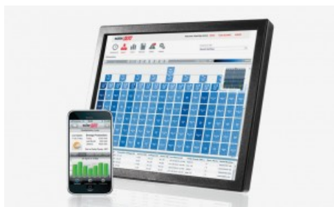
Inversores SolarEdge monofásicos