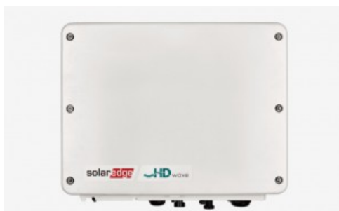
SolarEdge SE HD Wave

SolarEdge's HD-Wave technology inverter, winner of the prestigious 2016 Intersolar award, breaks the mold of traditional inverters.