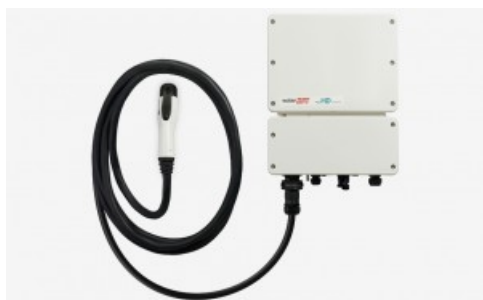
SolarEdge HD Wave VE

The SolarEdge DC-AC PV inverter is specifically designed to work with the