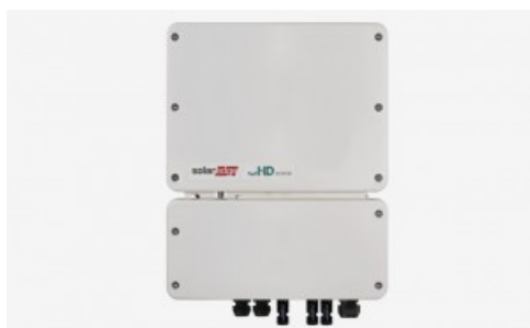
StorEdge SE HD Wave