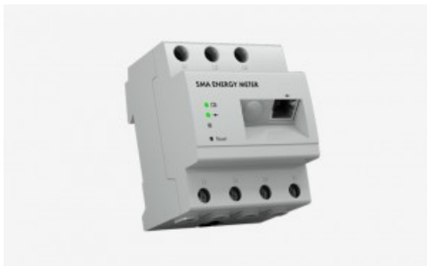
SMA Energy Meter

Solución de medición para una gestión inteligente de la energía en plantas fotovoltaicas con equipos de SMA.