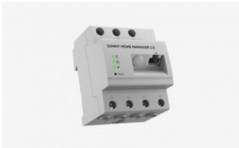
SMA Home Manager