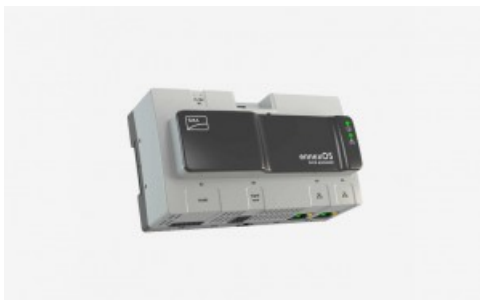
SMA Data Manager M

A high-performance measurement solution for intelligent energy management in PV systems with SMA devices. The SMA Energy Meter calculates phase-exact and balanced electrical measured values and communicates these via Ethernet in the local network. In this way, all data on grid feed-in and purchased electricity as well as PV generation by other PV inverters can be communicated to SMA systems frequently and with a high level of precision.