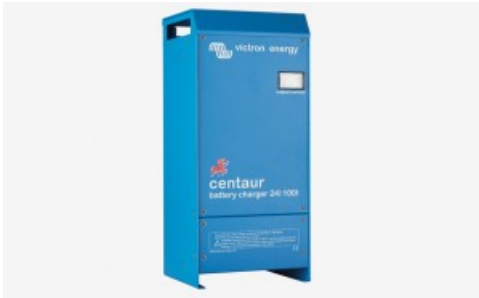
Cargador de baterías Victron Energy Centaur