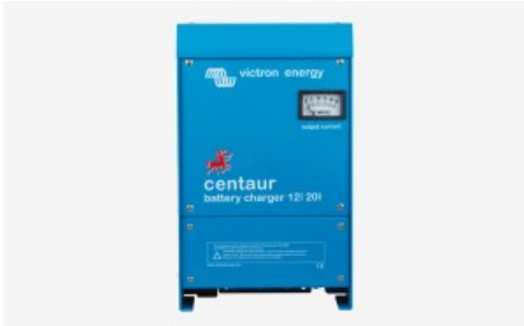
Cargador de baterías Victron Energy Centaur