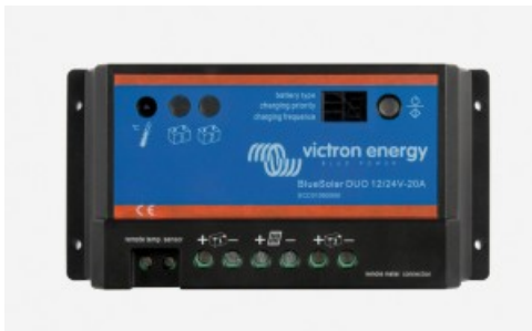
Regulador Solar Victron Energy BlueSolar DUO