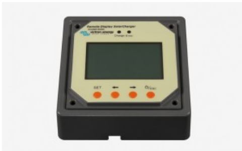
Display Regulador Solar Victron Energy BlueSolar DUO