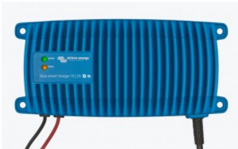
BlueSmart IP 67

BlueSmart IP67 Chargers 12V 7/13/17/25 Amp - 24V 4/8/12 Amp