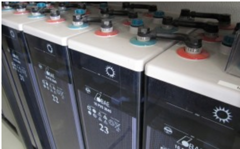
Batería Estacionaria BAE 16 PVS 3040