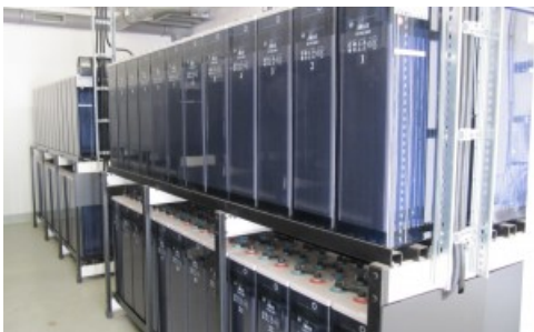
Batería Estacionaria BAE 16 PVS 3040

BAE Secura PVS solar batteries need only low maintenance and are used to store electric energy in medium and large solar photovoltaic installations.