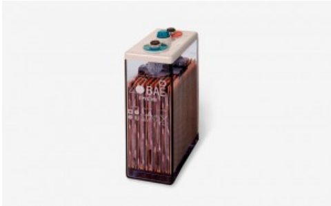
Batería Estacionaria BAE PVS