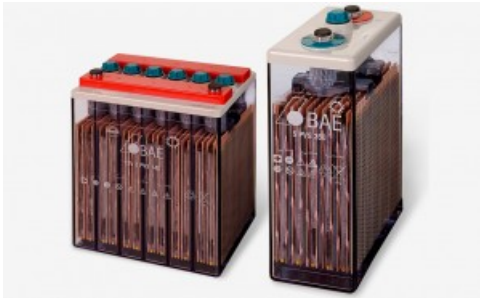
Baterías Estacionarias BAE PVS