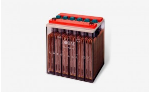
Batería Estacionaria BAE PVS Block