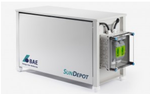
Batería Estacionaria Bae SunDepot

BAE Secura PVS solar batteries need only low maintenance and are used to store electric energy in medium and large solar photovoltaic installations.