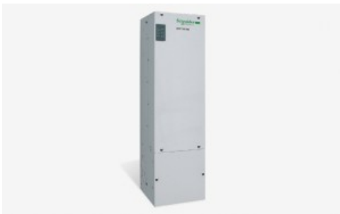
Bornay Schneider Electric Conext XW MPPT