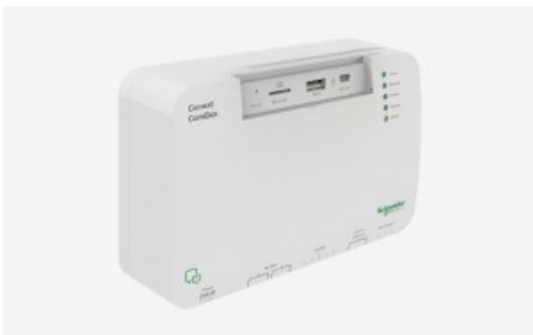
Bornay Schneider Electric Conext ComBox