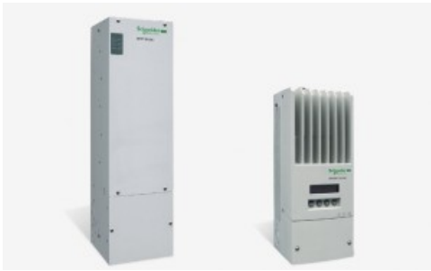
Bornay Schneider Electric Conext XW MPPT