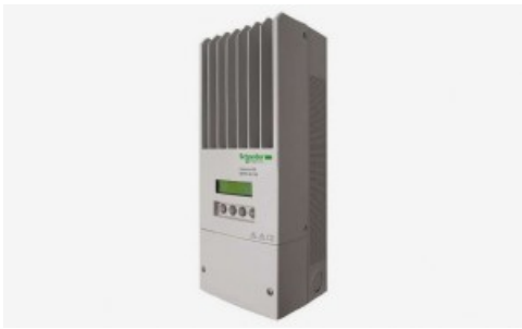
Bornay Schneider Electric Conext XW MPPT