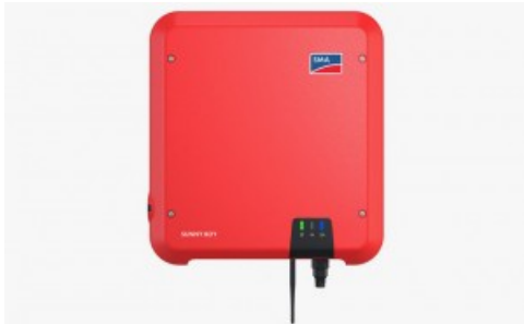
Sunny Boy 3.0 - 5.0

The new Sunny Boy 3.0 – 6.0 succeeds the globally successful Sunny Boy 3000 – 5000TL and it is more than just an inverter. Smaller, simpler and more convenient with SMA Smart Connected