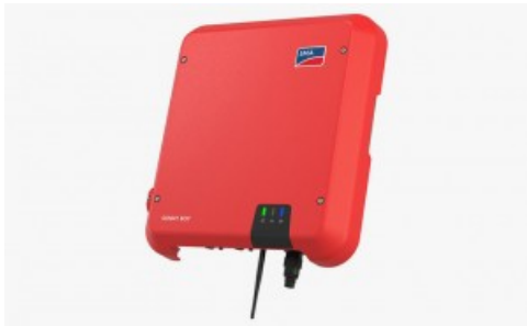
Sunny Boy 3.0 - 5.0

The new Sunny Boy 3.0 – 6.0 succeeds the globally successful Sunny Boy 3000 – 5000TL. It is more than just a PV inverter: with the integrated SMA Smart Connected service, it offers all-round comfort for PV system operators and installers alike. The automatic inverter monitoring by SMA analyzes operation, reports irregularities and thus minimizes downtime.