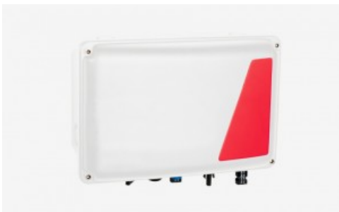
StorEdge SESTI S4

Homeowners can increase their energy independence and savings by storing excess solar production on a battery for use when needed, day or night.