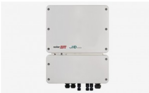
StorEdge SE HD Wave