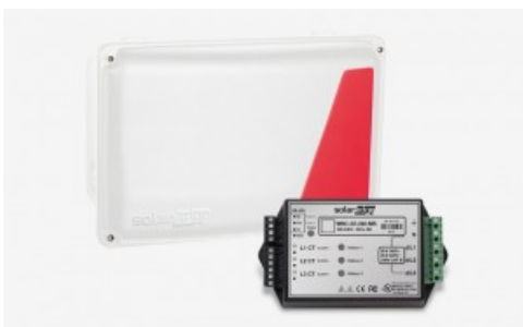
StorEdge SESTI S4 + Meter