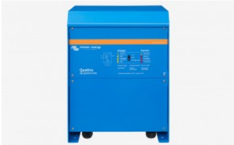
Inversor / Cargador Victron Energy Quattro