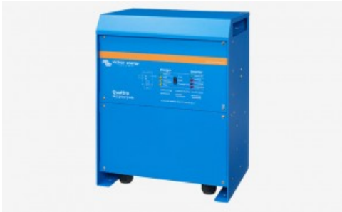
Inversor/Cargador Victron Energy Quattro