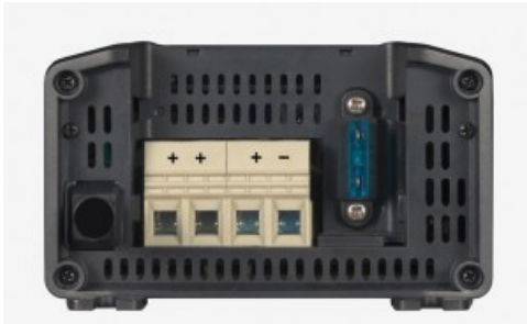
Cargador de baterías Victron Energy BluePower IP22