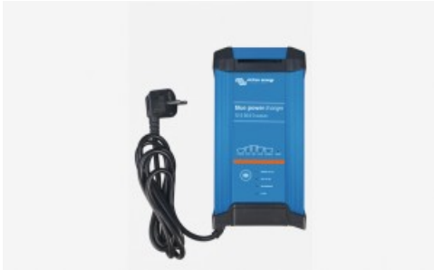
Cargador de baterías Victron Energy BluePower IP22