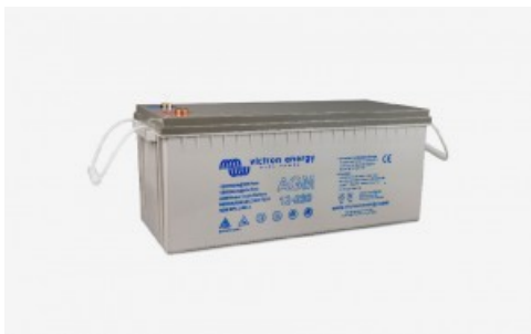
Bateria AGM Super Cycle

A truly innovative battery, the AGM Super Cycle batteries from Victron Energy.